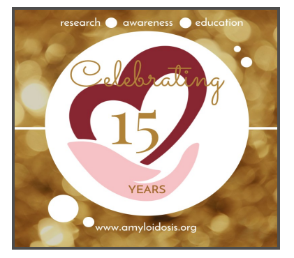
Anniversary Open House September 20, 2018 3:30pm—7pm

Please share with your family & friends. Register today