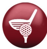
Nick Hamp & friend ready to tee off!