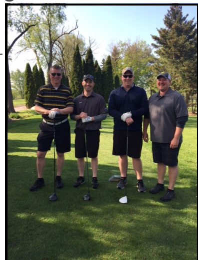
More photos on page 8

We appreciate our sponsors (special thanks to Prothena), volunteers and most of all the golfers for playing – see you next year! AF