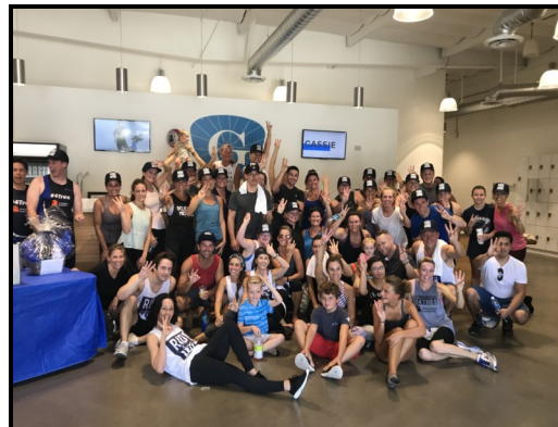
The GritCycle crew!